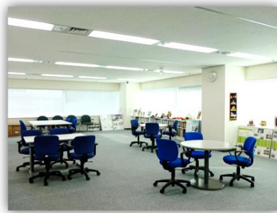
JICA Plaza Tohoku